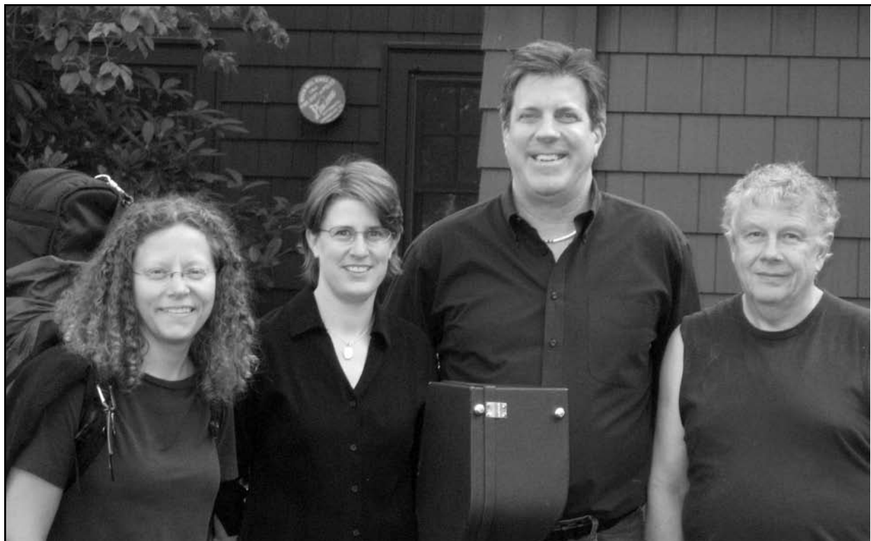
La Stella performs at First, Portland in November.