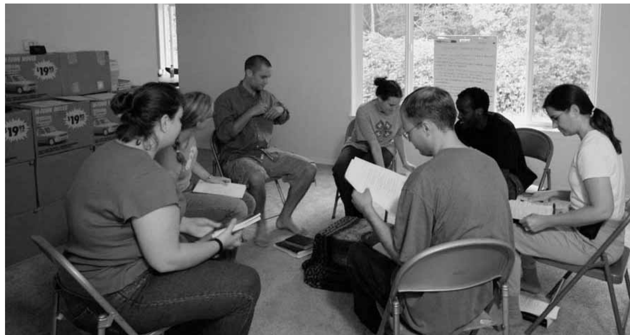
A Synago group gathers to plan future activities.

Students "buy in" and have ownership of ministry. Less a consumer of programs that we non-students "do" for them, empowering students in an intentionally Christian spiritual