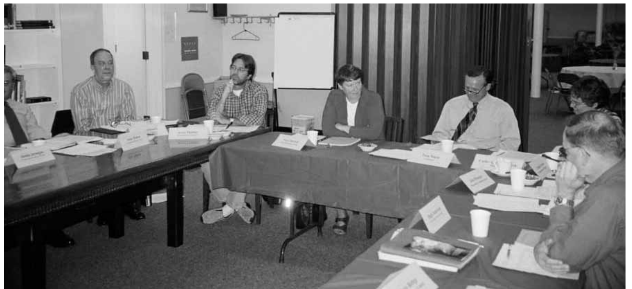
Council members meeting together to consider presbytery business.