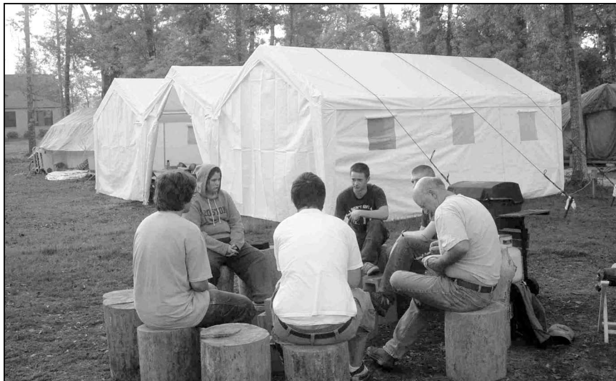
Part of the Katrina assistance crew from Portland, Multnomah shares the day's experience in a camp behind Community Church in Diamondhead, Mississippi in late March.