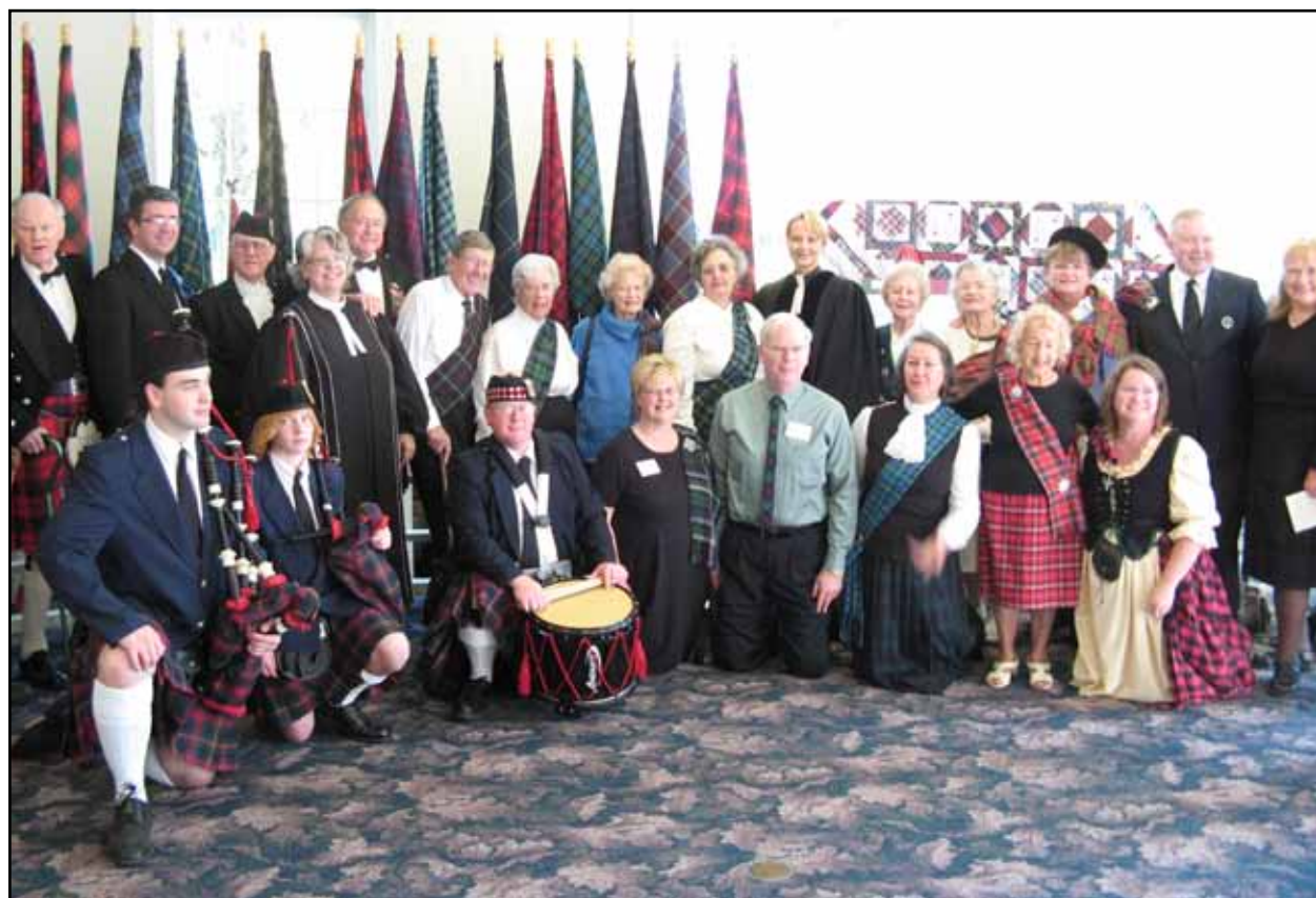
Members of First, Salem get into the spirit of "Kirkin of the Tartans."

Centuries later in April, 1941, at the New York Avenue Presbyterian Church in Washington D. C., the Rev. Dr. Peter Marshall inaugurated the first Kirkin in the U.S. This unique service of worship was not only a celebration of family and clan kinship but also