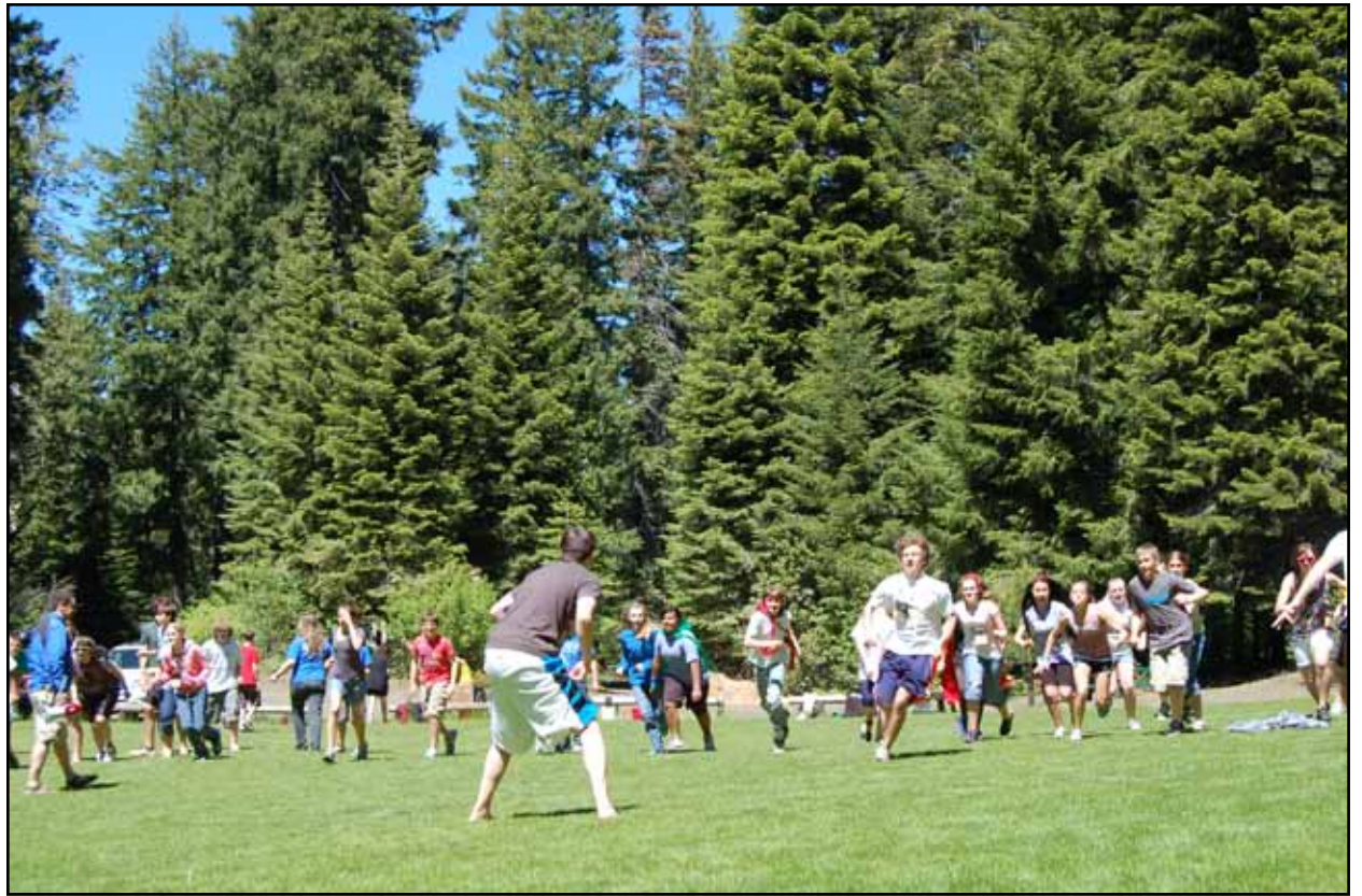
Campers enjoying a beautiful day at Suttle Lake

"The most common faith immersions in youth ministry are camps, retreats, mission trips, youth conferences, and other temporary Christian subcultures that plunge teenagers into communities that are structured to emphasize God's immediacy and activity. In the Christian camp or retreat subculture, daily rhythms may be patterned on gospel narratives, and religious language may be used without censure. Ideally, participating in a congregation offers a similar plunge into Christian community, but except for highly sectarian groups that operate almost